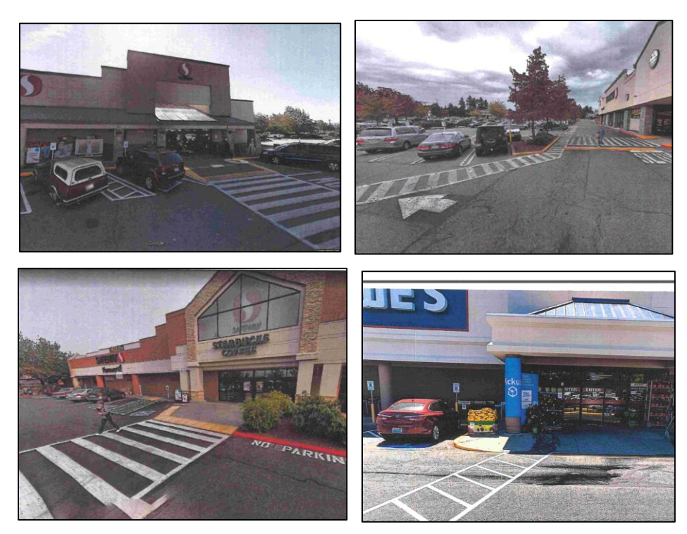
See CP 635-653 (multiple examples).

supposedly hazardous condition, but painted walkways in shopping plaza parking lots are common throughout the Pacific Northwest: